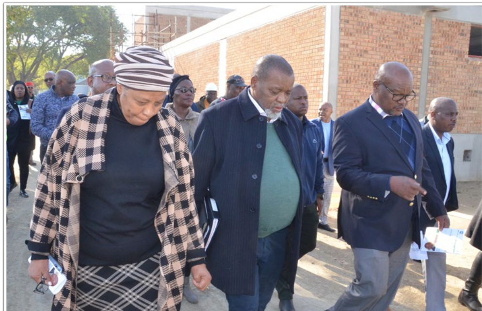
Minister Mantashe, flanked by Bojanala Platinum District Municipality Executive Mayor, Cllr. Matlakala Nondzaba (left) and the Executive Mayor of Madibeng Local Municipality, Cllr. Douglas Maimane during the recent visit to the Brits Water Treatment Plant - Pictures by Kagiso Diutlwileng