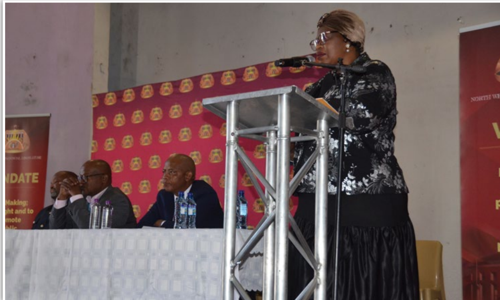
Speaker of the North West Provincial Legislature Hon. Basetsana Dantjie addresses the house