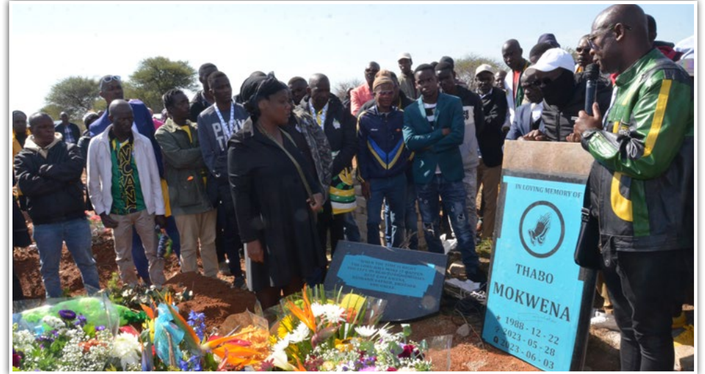
The Final resting place for the late Cllr. Mokwena, Lethakaneng Cemetery