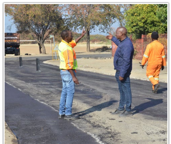
The project to re-seal all tarred roads in Damonville is nearing completion - Pictures by Tumelo Tshabalala