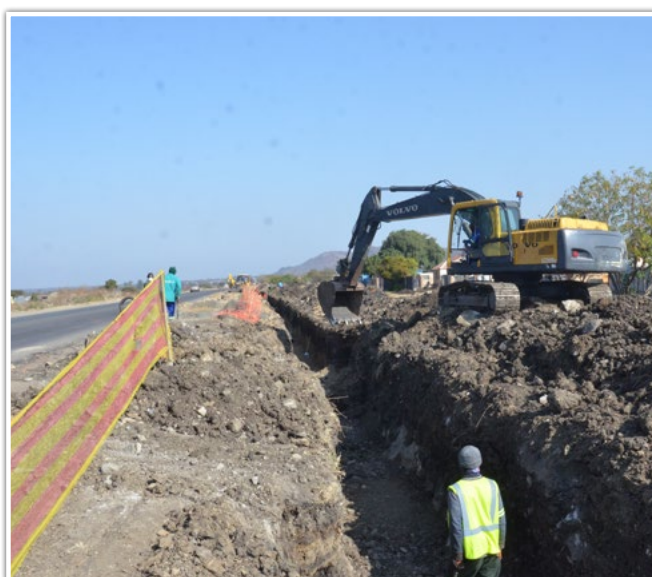
The project to re-route bulk sewer line in Mothotlung is underway