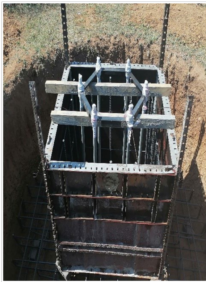
Installation of solar high mast lights - Picture by Kagiso Diutlwileng