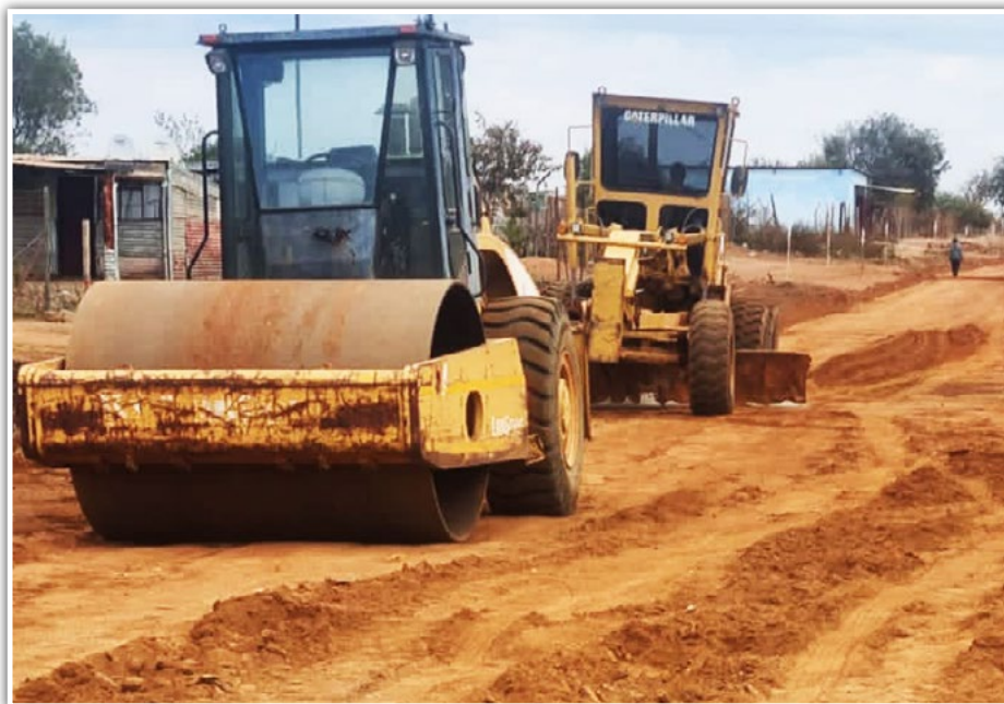
The upgrade of KL road in Maboloka takes shape