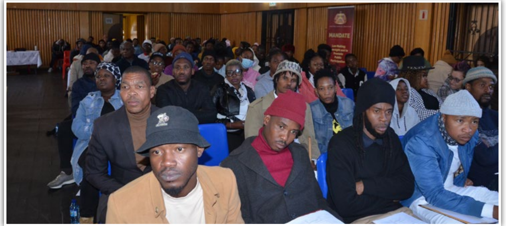
Some of the youth people who attended the Youth Parliament