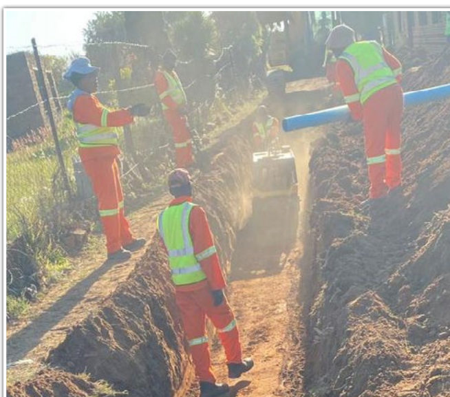
Phase 9 of the Kgabalatsane Water project underway