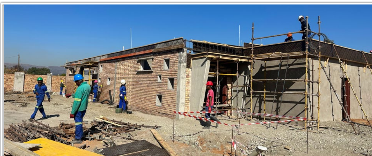
Mmakau Library