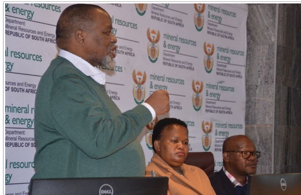
Minister of Mineral Resources and Energy, Hon. Gwede Mantashe addresses the Bojanala District Development Model (DDM) meeting with MEC Galebekwe Tlhabi and Executive Mayor, Cllr. Douglas Maimane listening attentively.