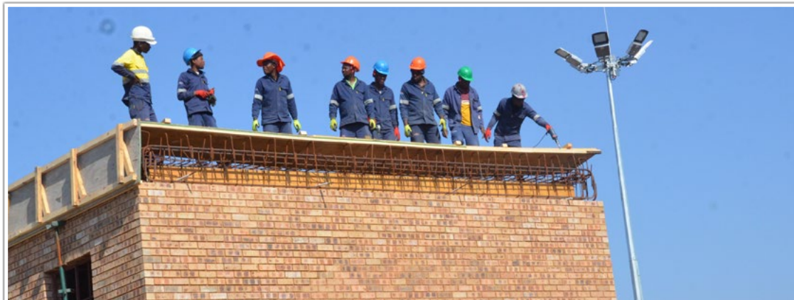
Construction work in full swing at the site of the Brits Water Treatment Plant.