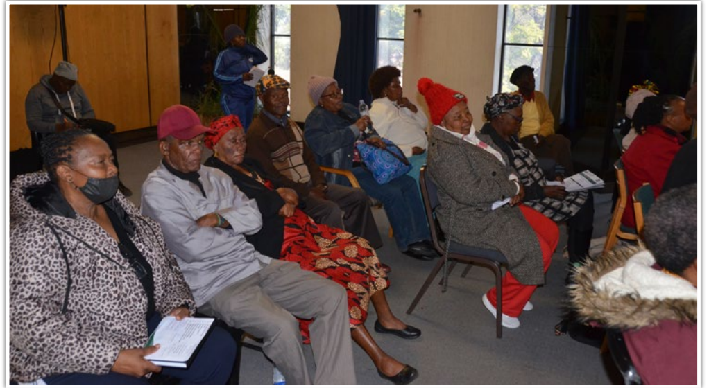
Some of the attendants of the launch of the elderly people committee