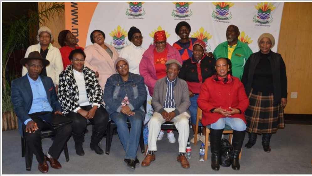
The newly elected Committee of the elderly people in Madibeng