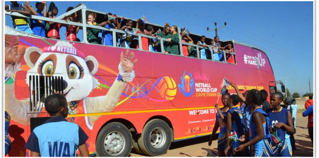
Bus arrives in Hebron carrying netball players from Brits Schools

The Acting Mayor, received the trophy, saying: "It gives me great pleasure to receive this trophy