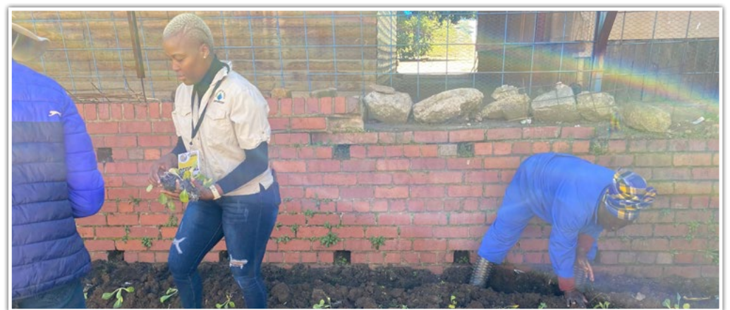
A vegetable garden being establish to help supply the locals with some fresh produce

"The youth of 1976 fought for what we have today, but this generation's fight is different. What will we do today? We are a food insecure country. But we have a beautiful climate in the North West and we have an advantage when it comes to agriculture. We have two colleges of agriculture in this province. Why are people going to bed hungry when we have fertile land around? What are you going to do about it?"